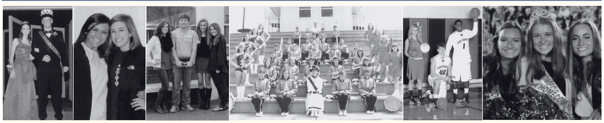
Office of Alumni Relations - Mission Statement

Welcome to our Alumni Winter Newsletter we're so glad you're here